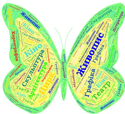
Fig. 7. Types of Art