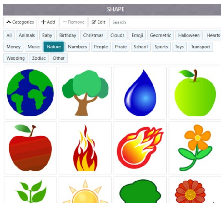
Fig. 5. Shapes for a Word Cloud

After selecting the shape, users proceed to the Font category and select the desired typeface. After that, in the Layout category, users determine a word placement (horizontal, vertical, overlap, random). They can also adjust the maximum word size (from 1 % to 100 %), word amount and density.