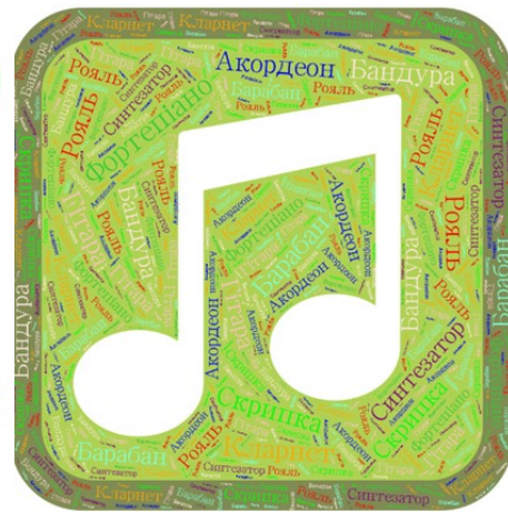
Fig. 8. Musical Instruments

The resource allows users to download the created word clouds in a standard quality (PNG, JPEG) for free and share the link, too. A premium plan is required to be purchased in cases of getting high-quality downloads.