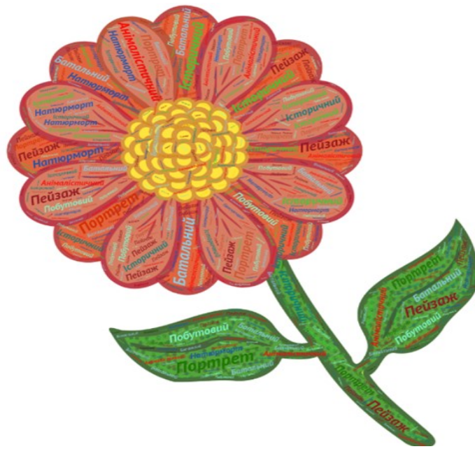
Fig. 6. Genres of Art