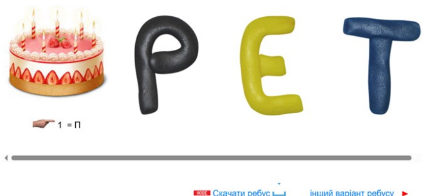
Fig. 10. Generated Rebus “Portrait”

Conclusion. Using word clouds and rebuses makes art lessons much more interactive, up-to-date and engaging, at the same time keeping students entertained and highly motivated to arouse their curiosity about art education. It is advisable to use these Internet resources at any lesson stage, actively involving students in the learning process in order to align with the needs of contemporary students.